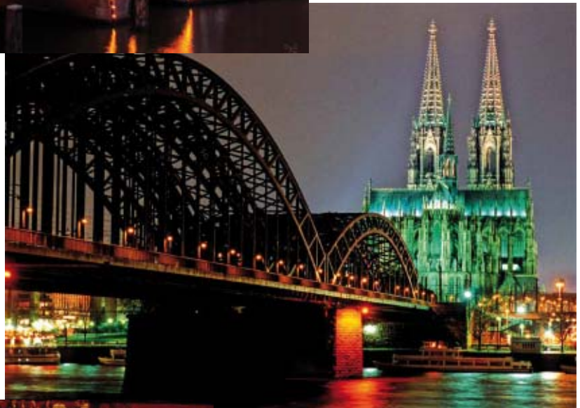
Cologne on the Rhine River