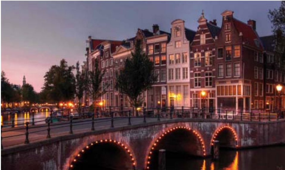
Amsterdam on the Holland Waterways