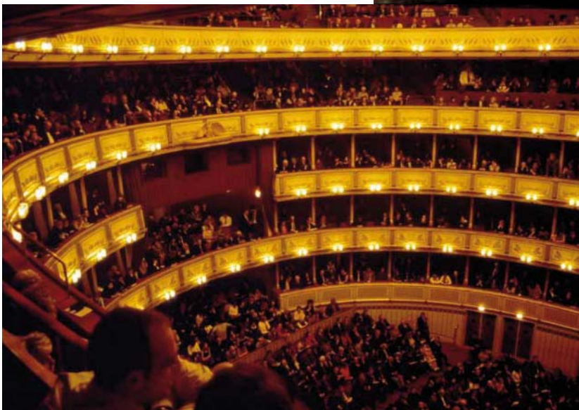
Vienna on the Danube River