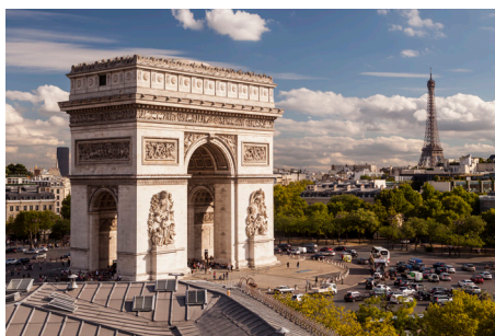
Arc de Triomphe, Paris, France