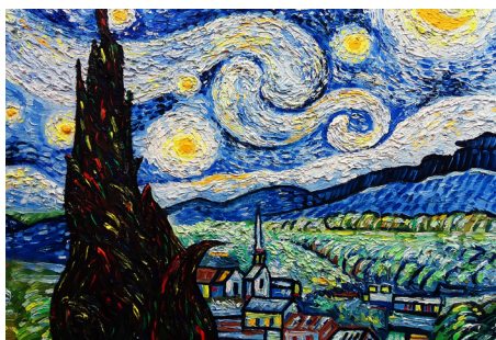
Trace the footsteps of Van Gogh