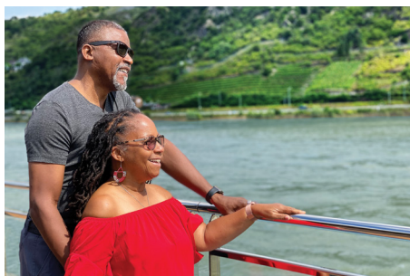
Enjoy fresh air and scenic views