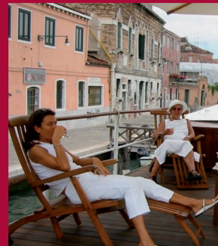
Enjoy a Drink on Deck