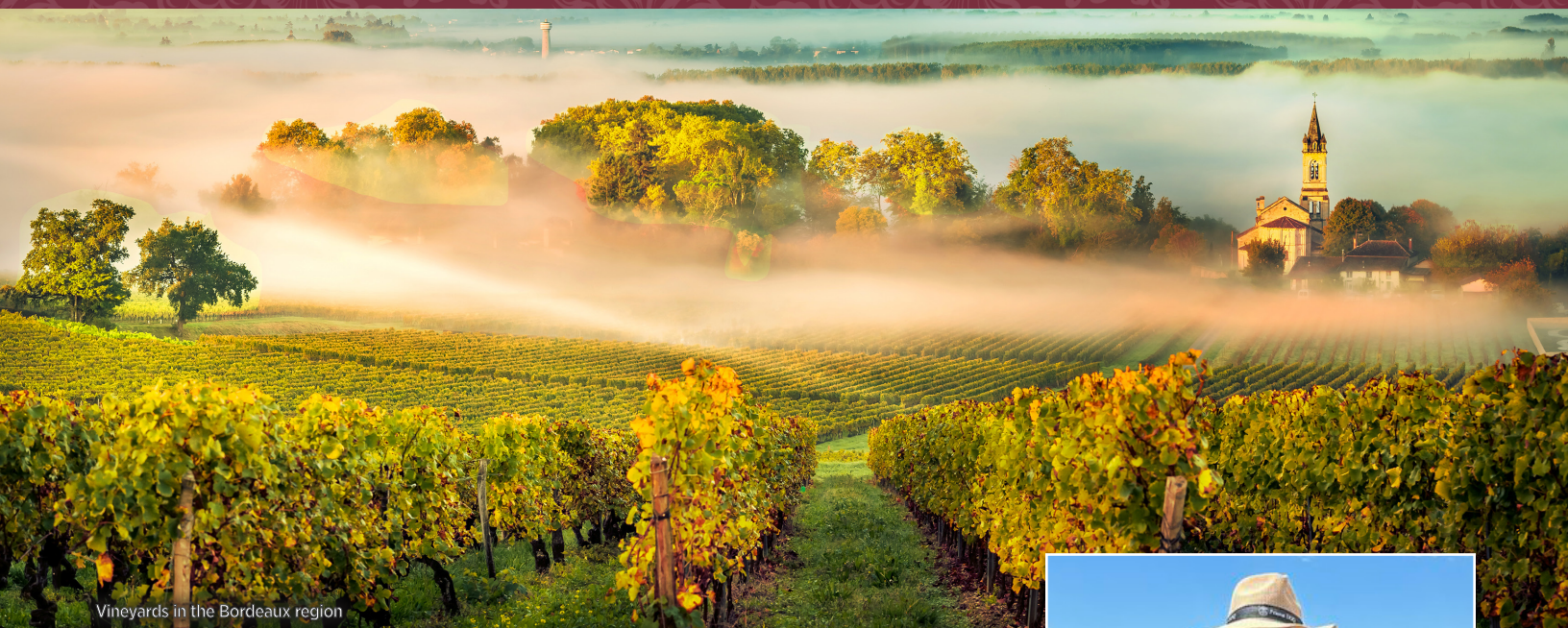
Vineyards in the Bordeaux region

Uncork local traditions, savor intense flavors and enjoy palate-pleasing adventures during an AmaWaterways Wine Cruise