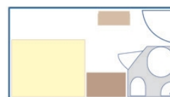
Cabin with a double bed